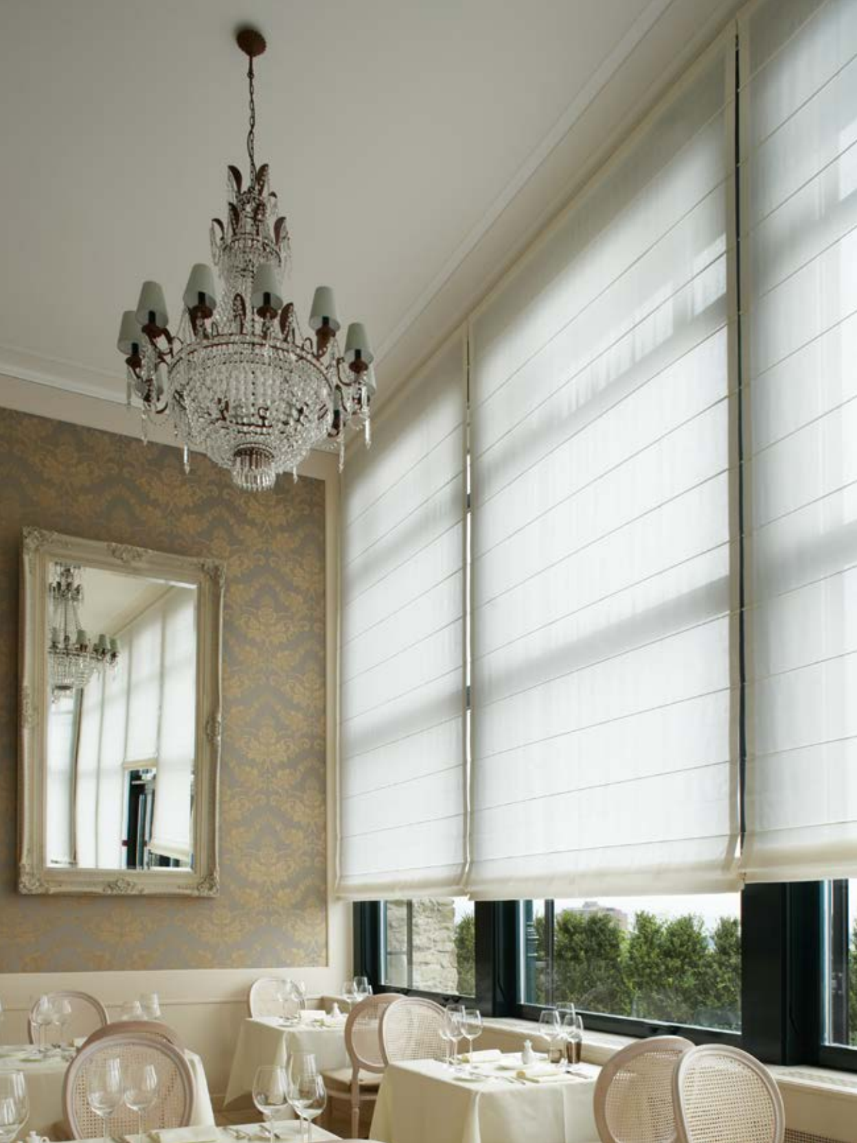
Roman Blind System Silent Gliss 2350