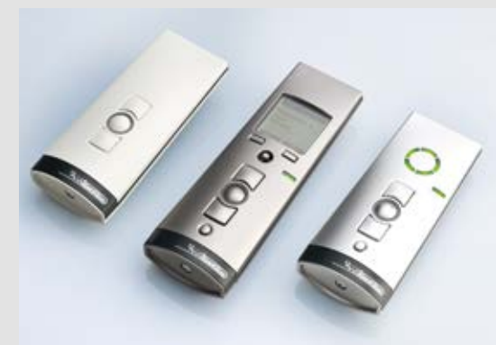
Remote controls Silent Gliss 9940