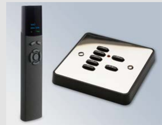
Remote controls Silent Gliss 0450